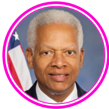
HANK JOHNSON Representative, Georgia District 4