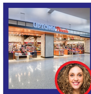
Joya Kizer Casa Unlimited Enterprises