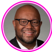
BYRON AMOS Councilmember, Atlanta City Council District 3